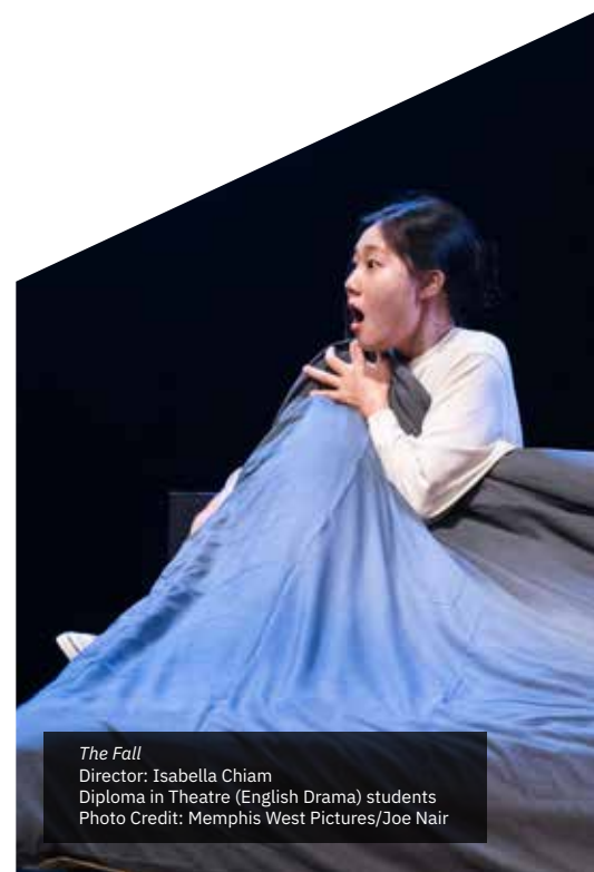
The Fall Director: Isabella Chiam Diploma in Theatre (English Drama) students